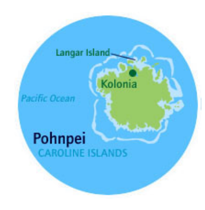
Story 1 - Pohnpei, Micronesia

In Aotearoa (New Zealand) alone, a range of stories are told. As in many Polynesian islands, there's the story of the boy Maui. From his canoe (Te Waka a Maui, the South Island), Maui fished up the North Island (Te Ika a Maui). There's the story of the navigator Kupe, who landed on the northwest shores. There are the stories of the canoes that navigated here from the island homeland of Hawaiki. And there's the story of Paikea, who arrived on the east coast of the North Island on the back of a whale.