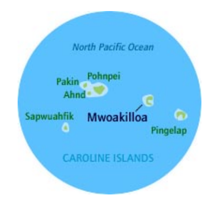
Story 2 - Mwoakilloa, Micronesia