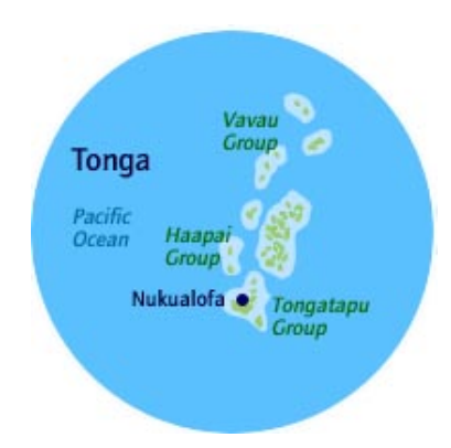
Story 3 - Tonga, Polynesia