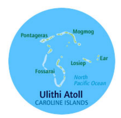
Story 5 - Ulithi, Micronesia