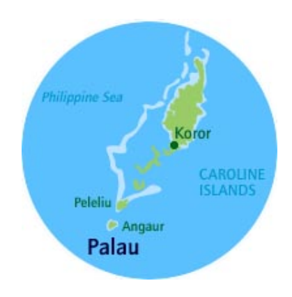
Story 6 - Palau, Micronesia

She made Mogmog her home because it had lots of turtles. There, she had a son. She taught him many skills, like building canoes. She sent him to Yap to bring coconuts back since there were none on Mogmog at the time. Today, Ulithi is covered in coconut trees.