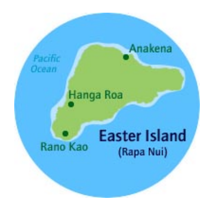
Story 4 - Rapa Nui, Polynesia