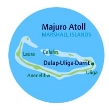
Story 7 - Majuro reefs, Marshall Islands, Micronesia

In other versions of this story, Chuab is called Uab.